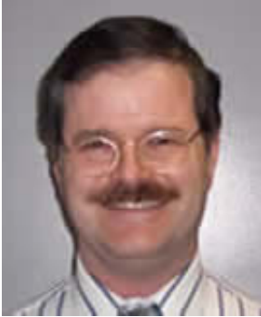
Mayor Jim Yonally