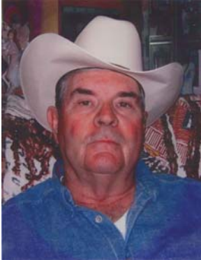
Mayor Tom McCain