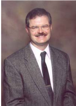
Mayor Jim Yonally